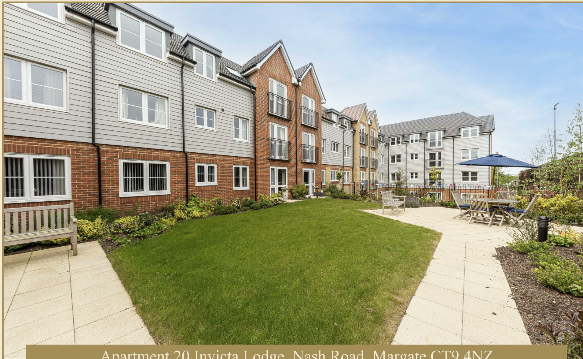
Apartment 20 Invicta Lodge, Nash Road, Margate CT9 4NZ