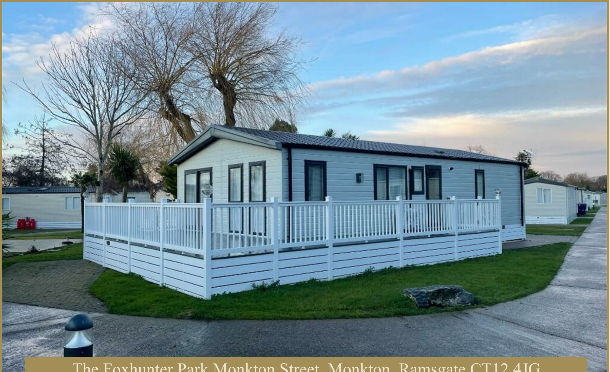
The Foxhunter Park Monkton Street, Monkton, Ramsgate CT12 4JG