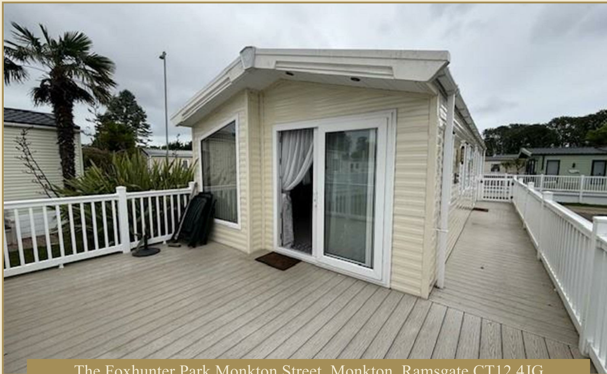
The Foxhunter Park Monkton Street, Monkton, Ramsgate CT12 4JG