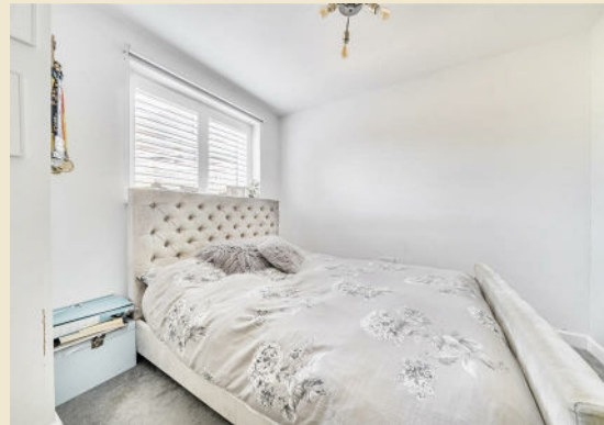
Bedroom 2 10'8 x 10' (3.24 x 3.04 m)