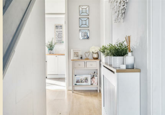
Kitchen / Dining Room 23'5 x 11'5 max (7.13 x 3.47 m max)