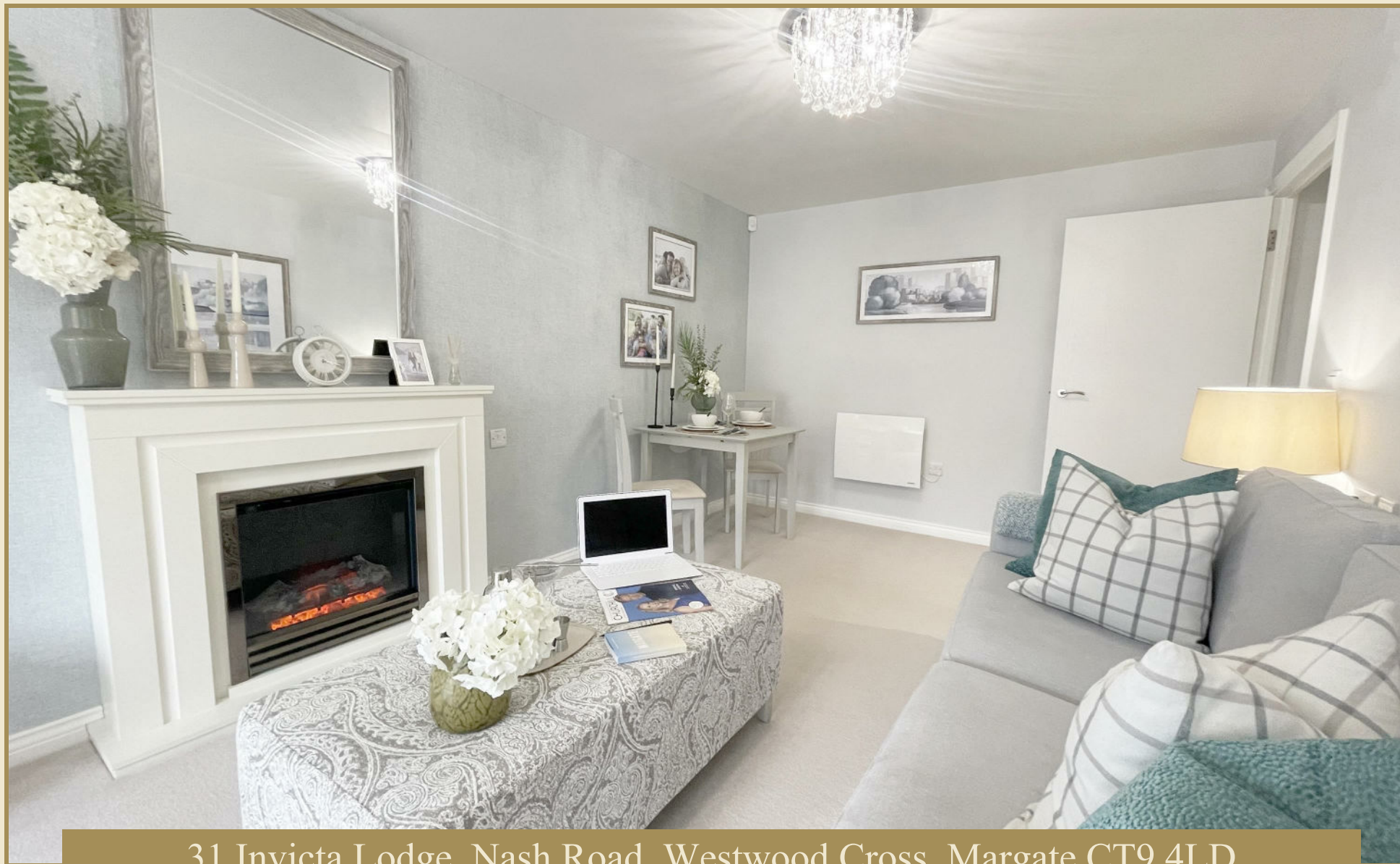
31 Invicta Lodge, Nash Road, Westwood Cross, Margate CT9 4LD