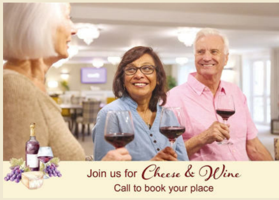
Join us for Cheese & Wine Call to book your place