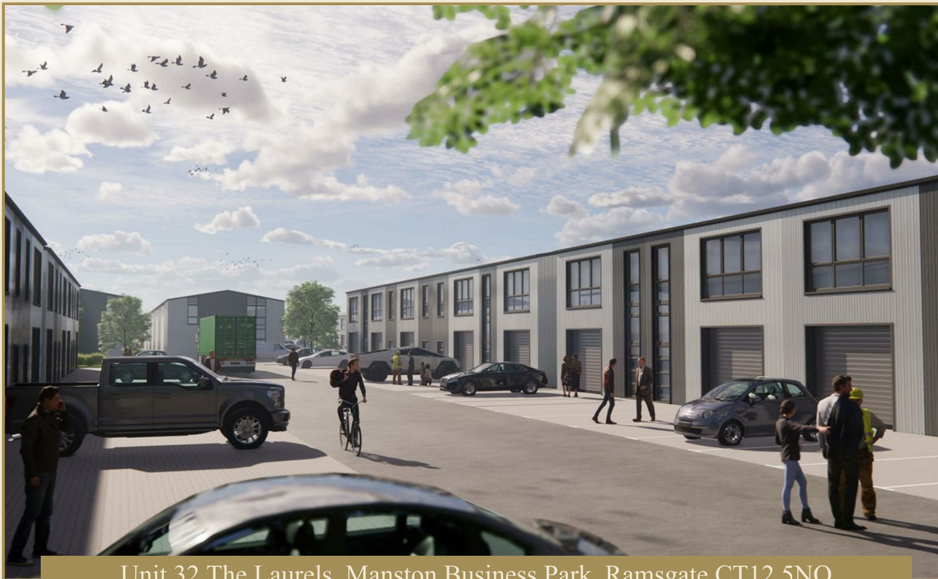
Unit 32 The Laurels, Manston Business Park, Ramsgate CT12 5NQ