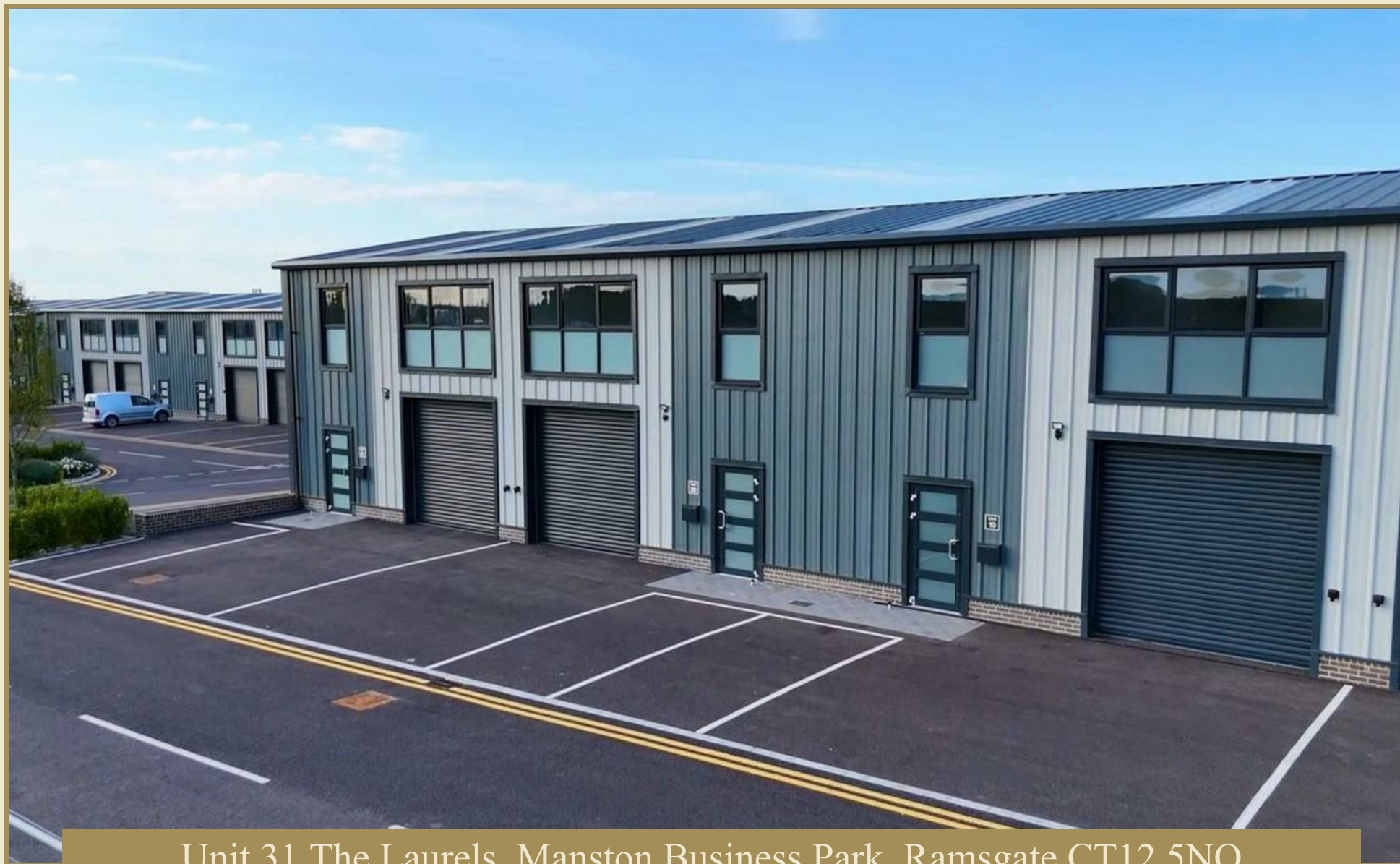
Unit 31 The Laurels, Manston Business Park, Ramsgate CT12 5NQ