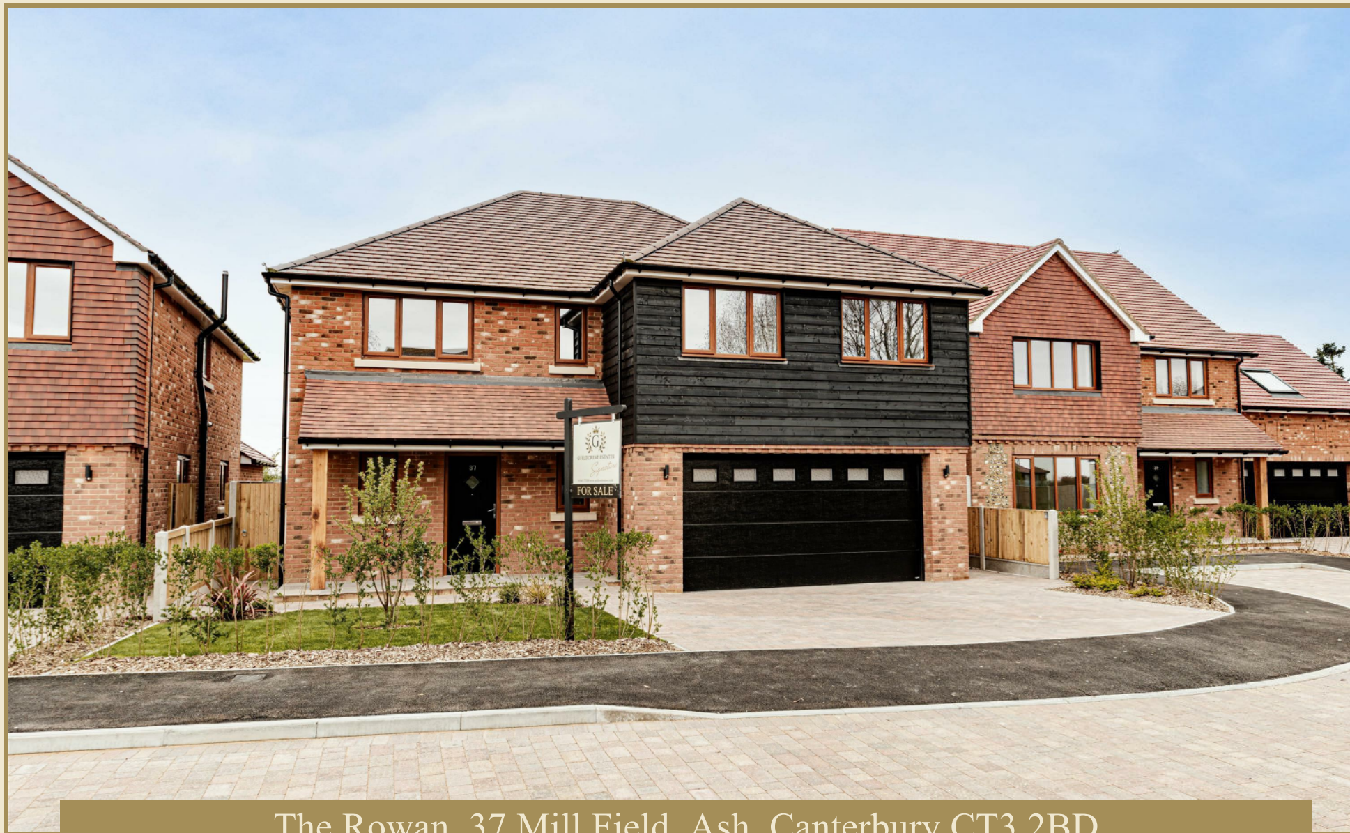
The Rowan, 37 Mill Field, Ash, Canterbury CT3 2BD