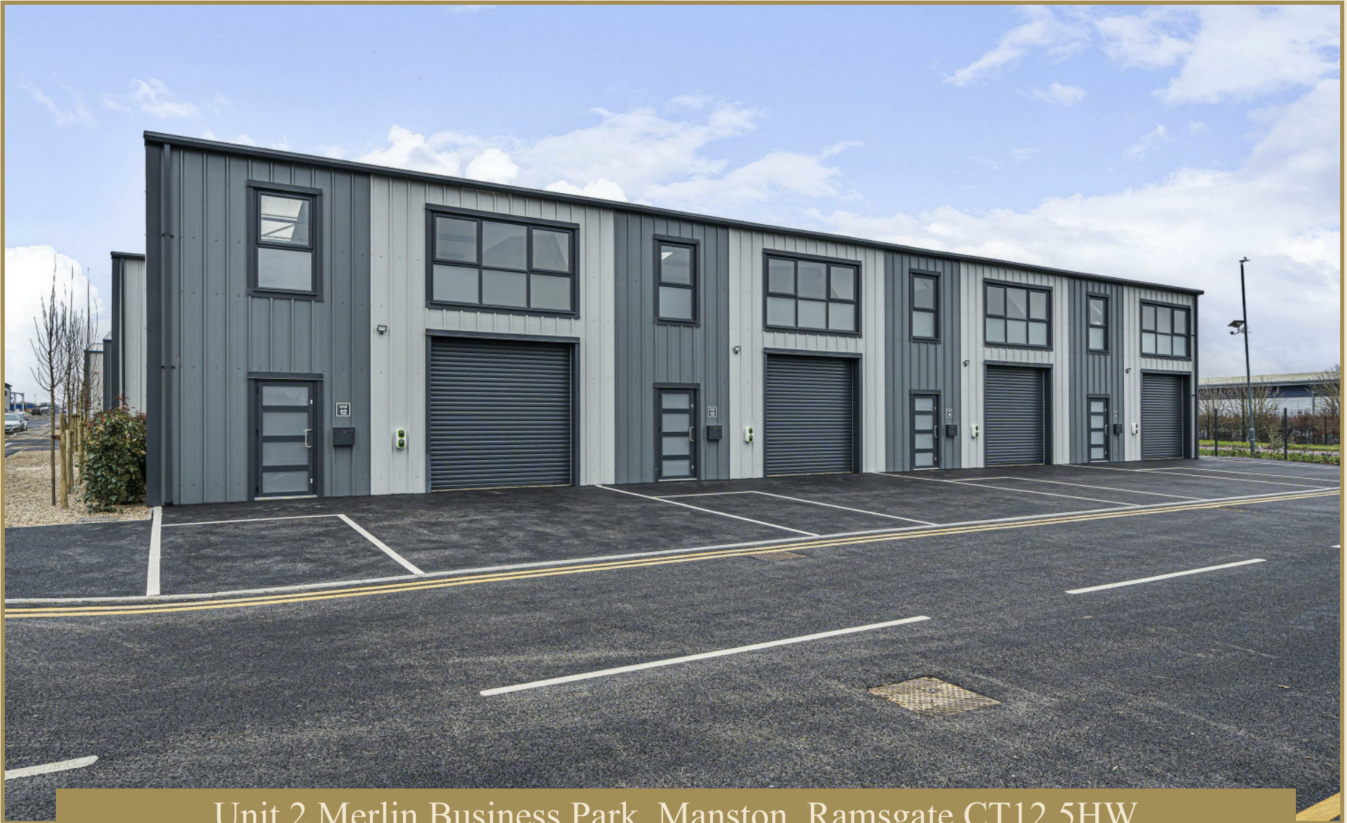
Unit 2 Merlin Business Park, Manston, Ramsgate CT12 5HW