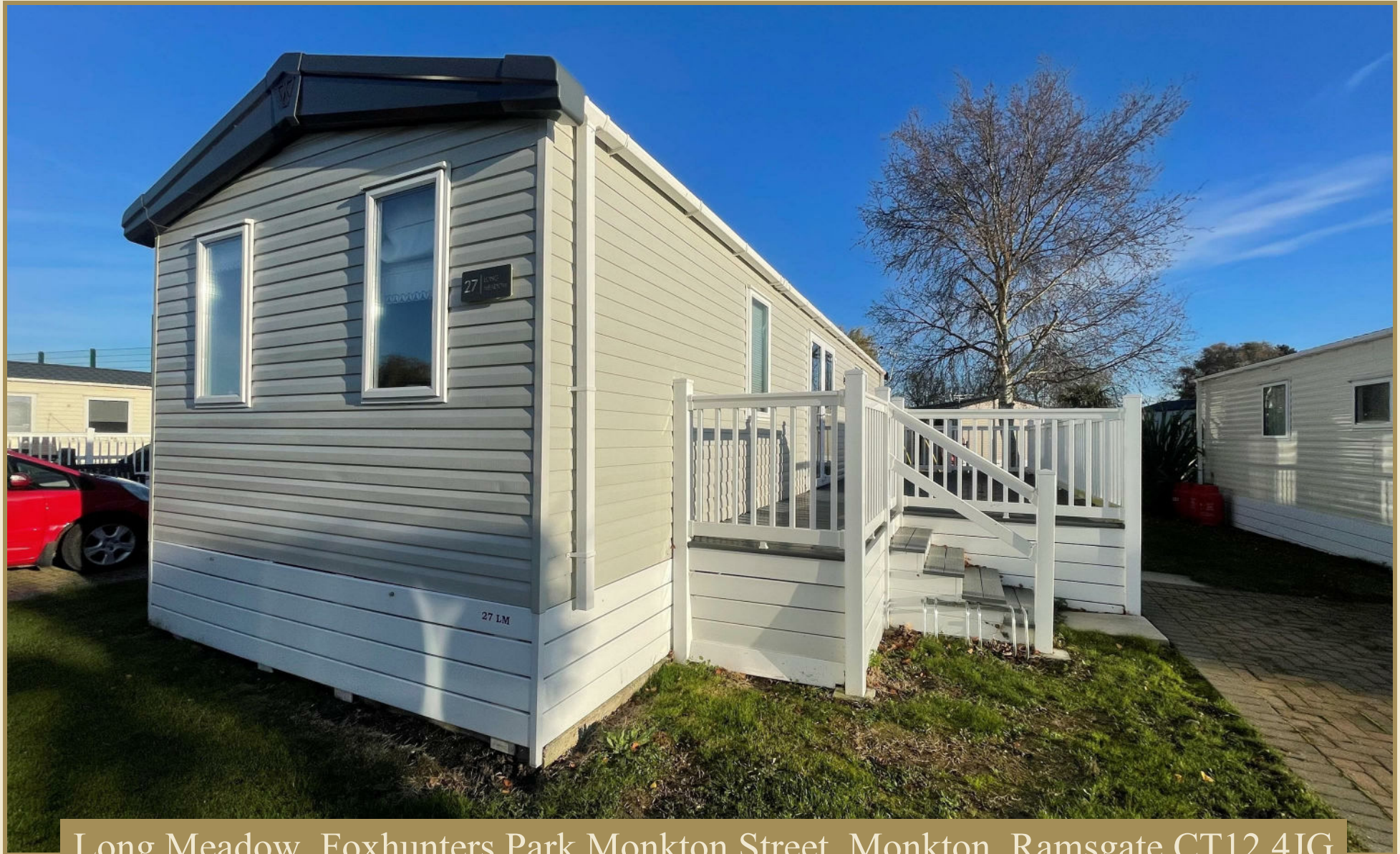
Long Meadow, Foxhunters Park Monkton Street, Monkton, Ramsgate CT12 4JG