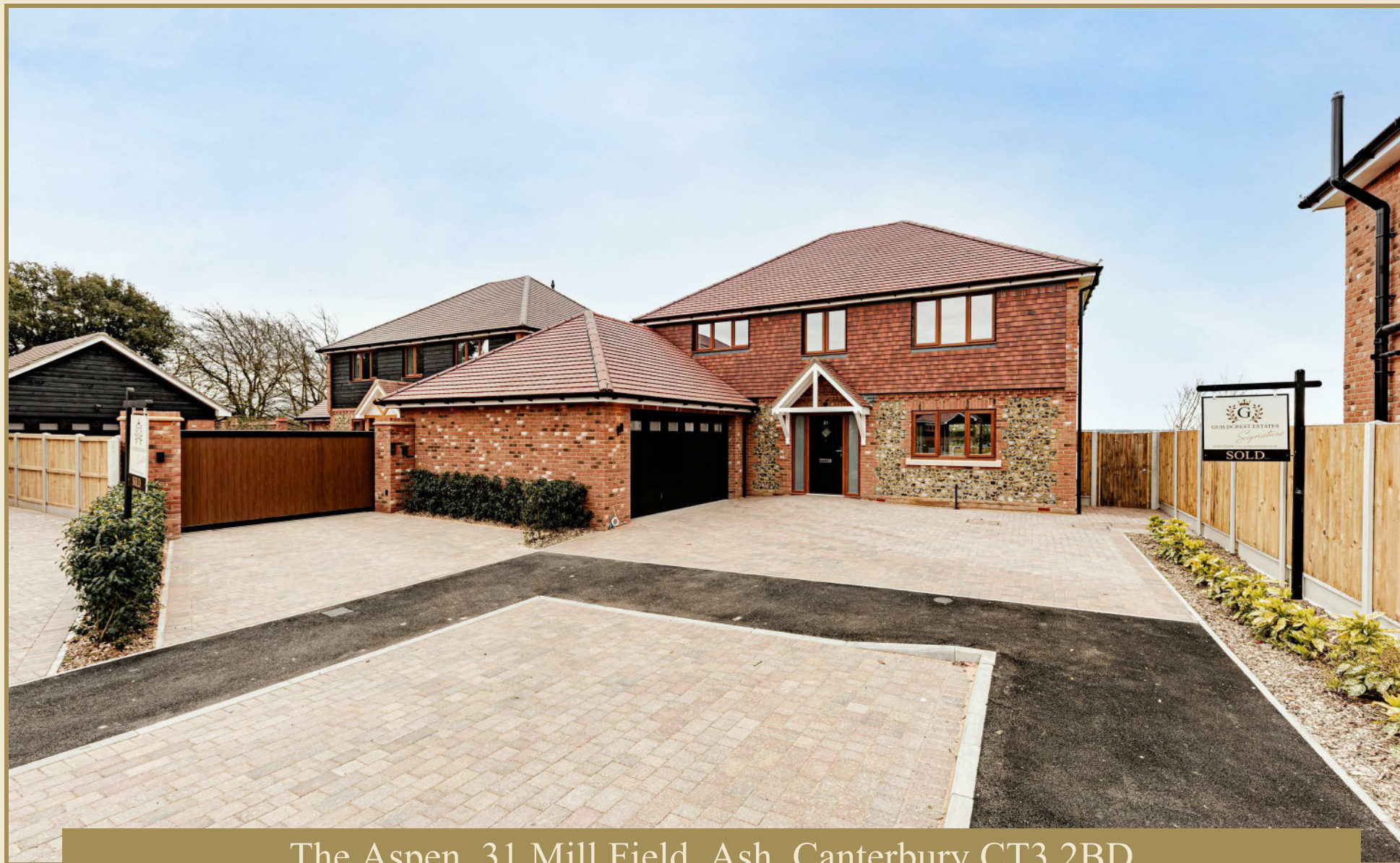
The Aspen, 31 Mill Field, Ash, Canterbury CT3 2BD