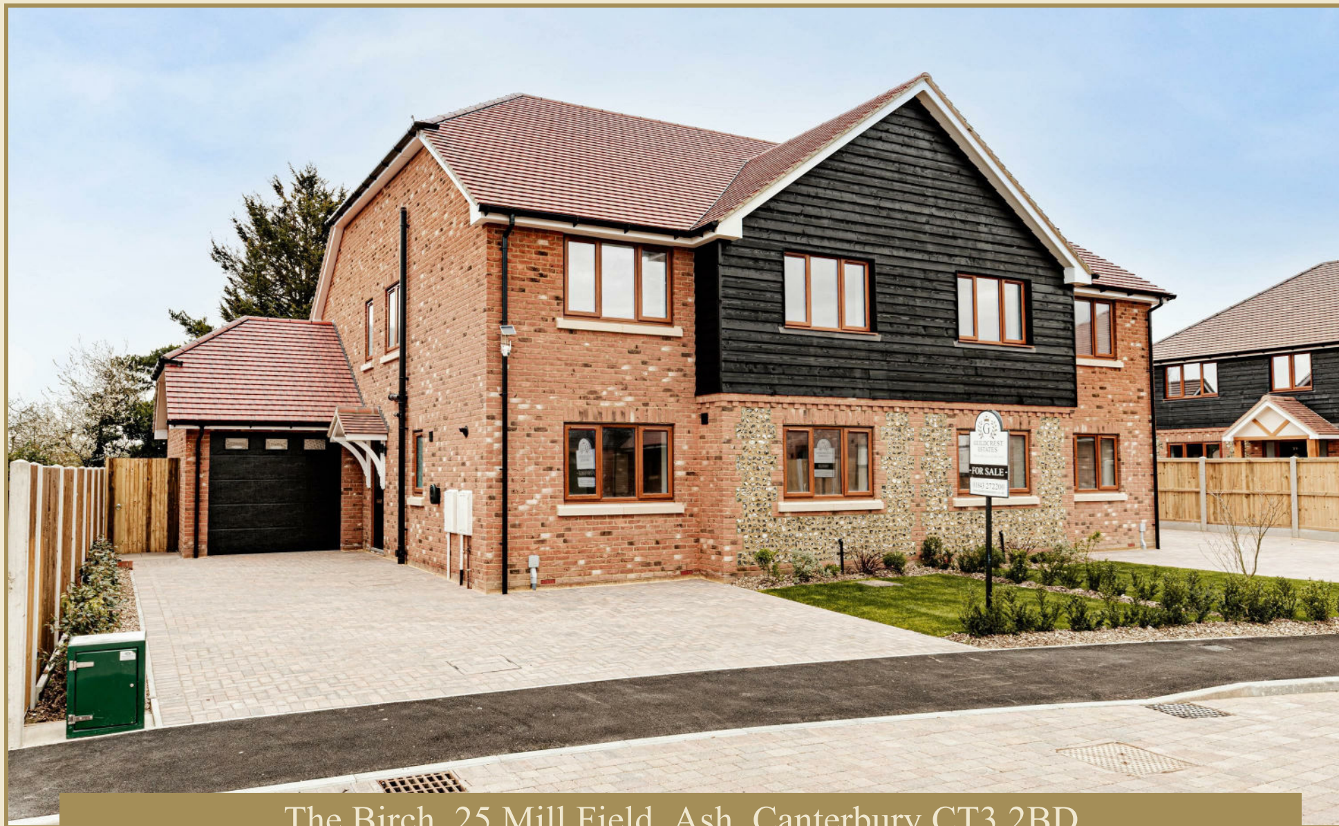
The Birch, 25 Mill Field, Ash, Canterbury CT3 2BD