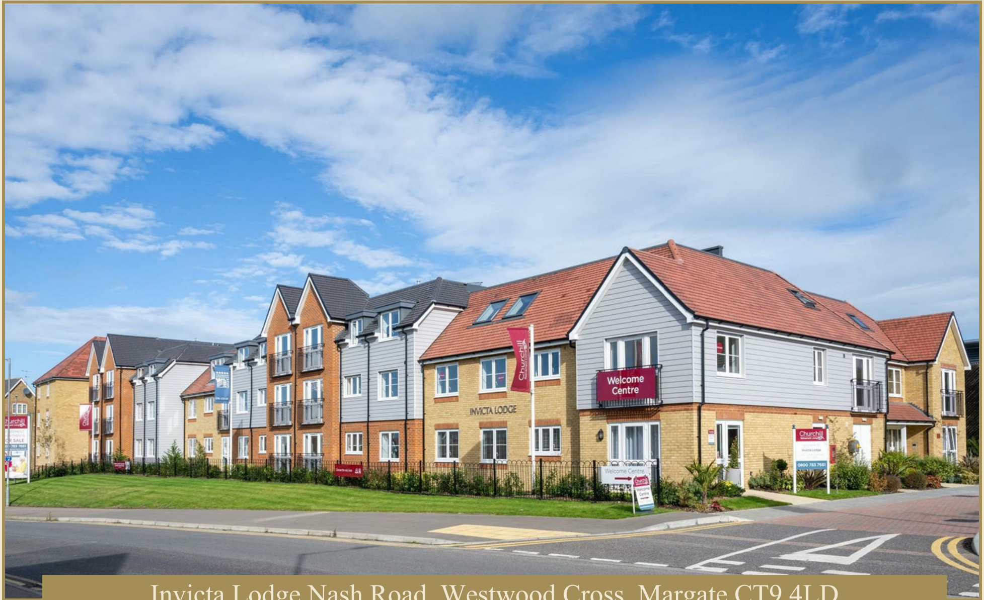
Invicta Lodge Nash Road, Westwood Cross, Margate CT9 4LD