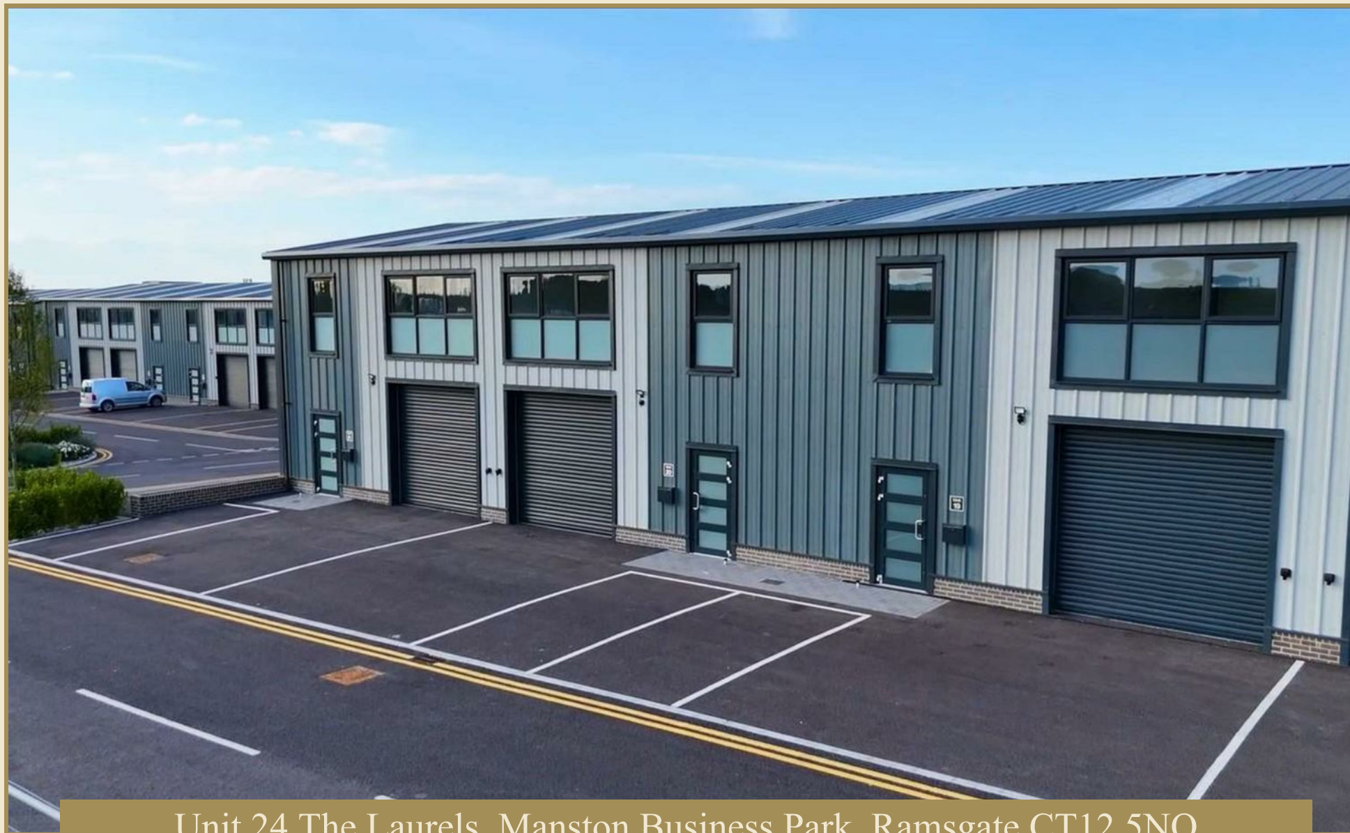
Unit 24 The Laurels, Manston Business Park, Ramsgate CT12 5NQ