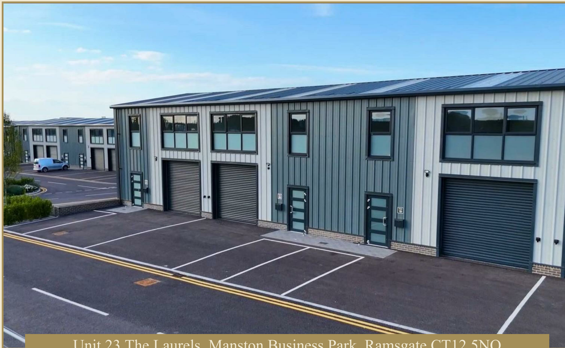
Unit 23 The Laurels, Manston Business Park, Ramsgate CT12 5NQ