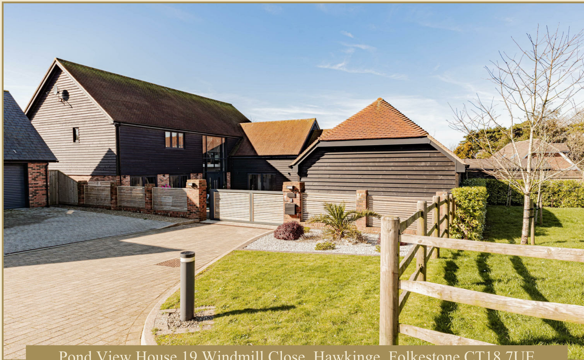
Pond View House, 19 Windmill Close, Hawkinge, Folkestone CT18 7UE