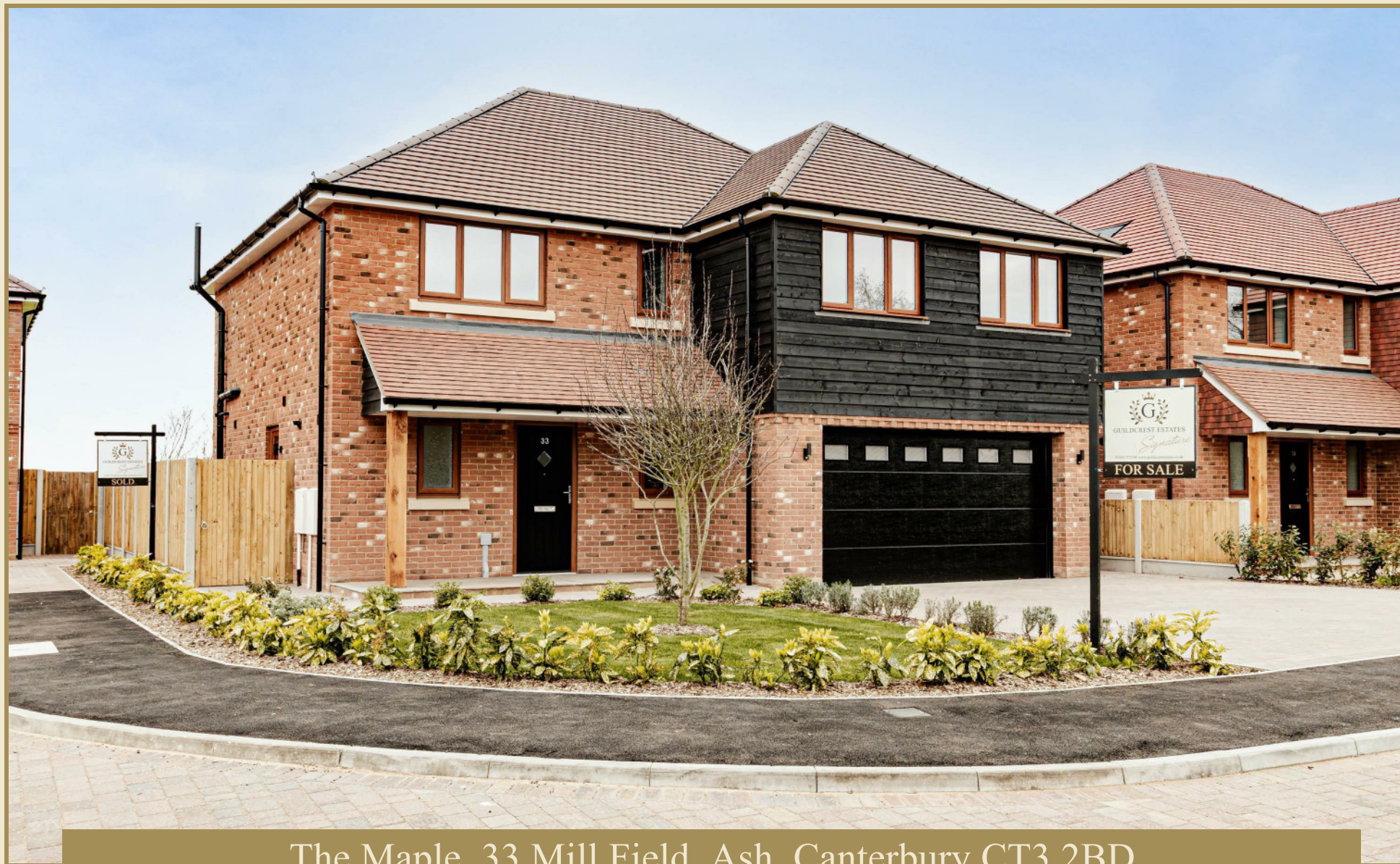
The Maple, 33 Mill Field, Ash, Canterbury CT3 2BD