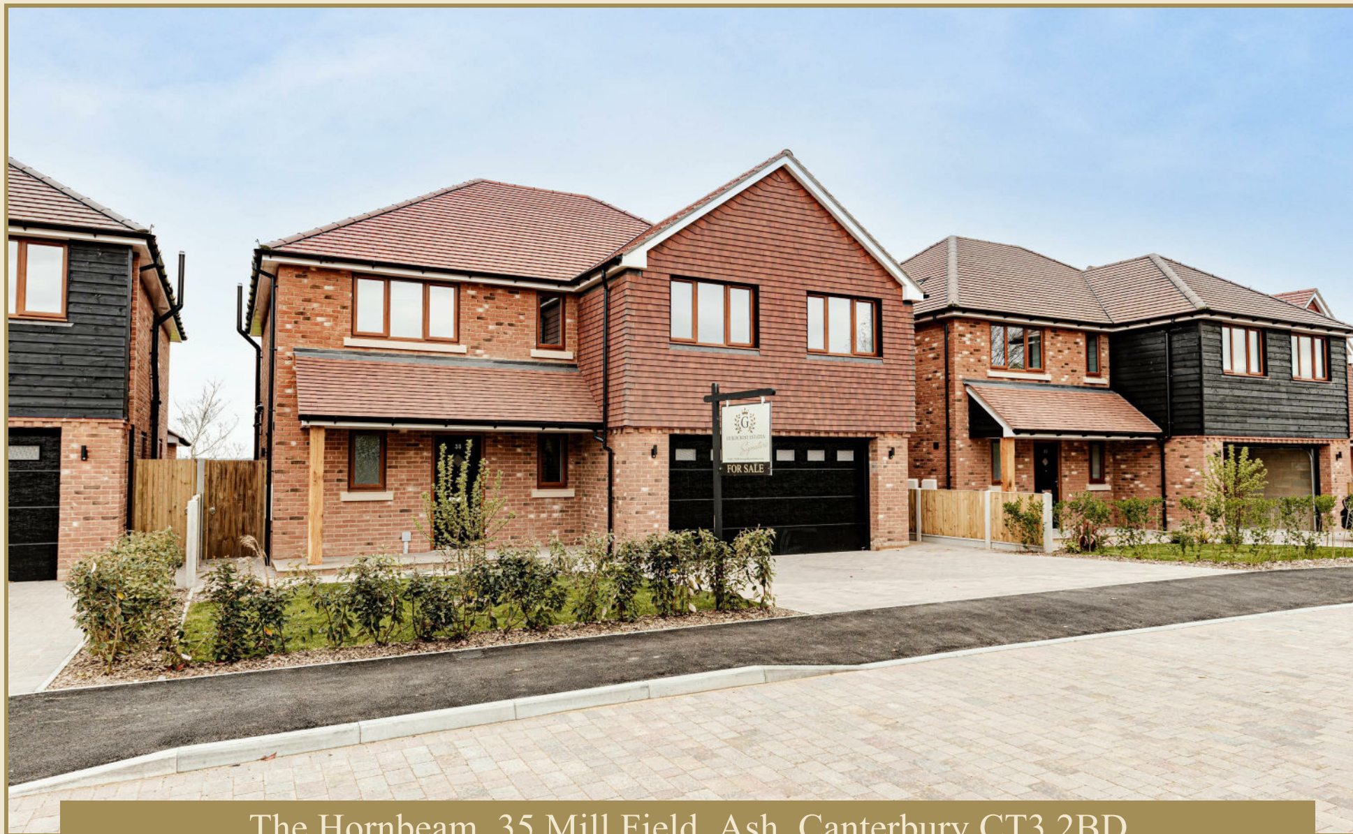
The Hornbeam, 35 Mill Field, Ash, Canterbury CT3 2BD