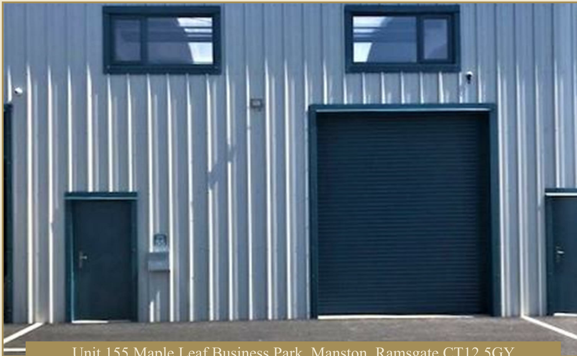
Unit 155 Maple Leaf Business Park, Manston, Ramsgate CT12 5GY