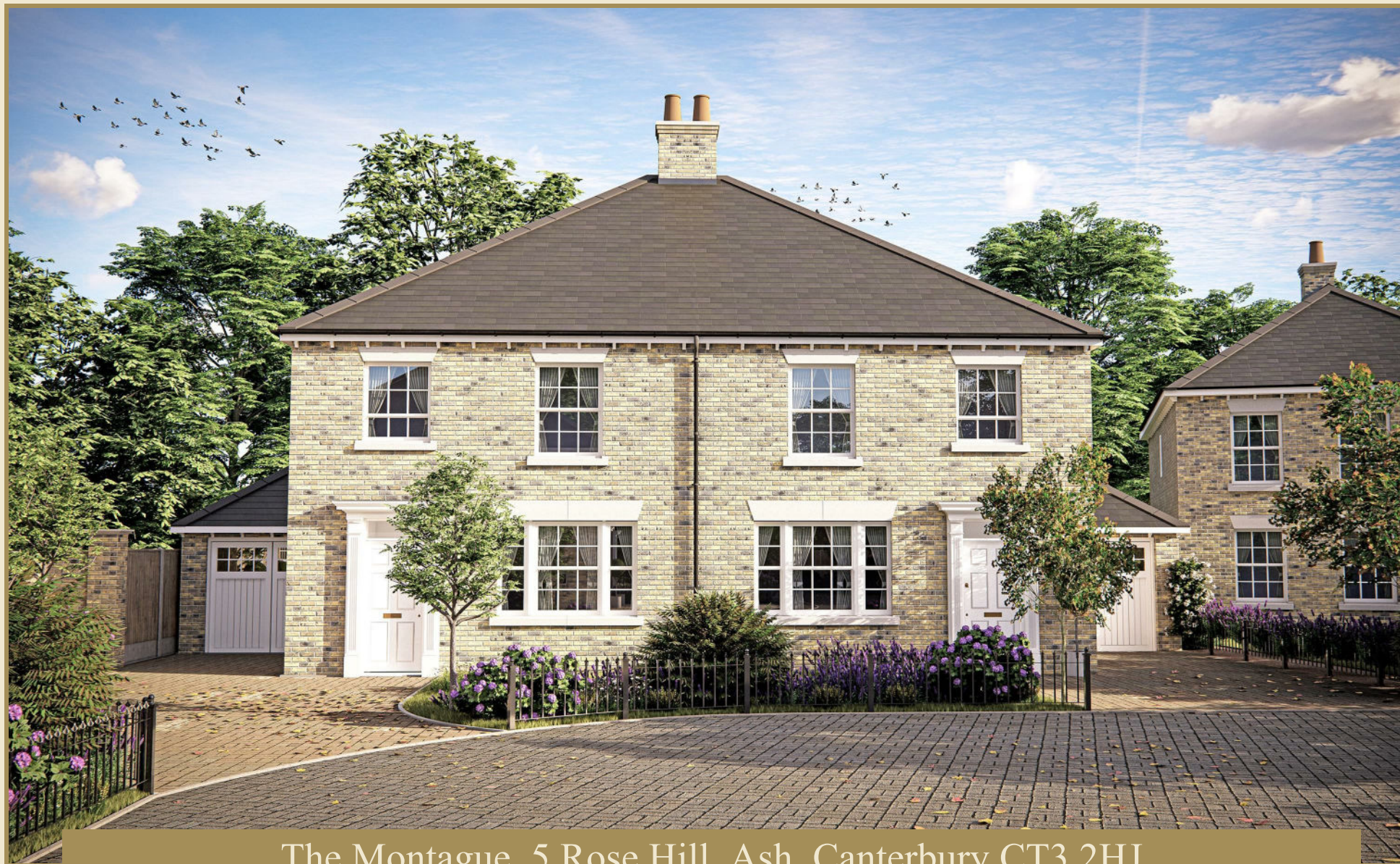
The Montague, 5 Rose Hill, Ash, Canterbury CT3 2HJ