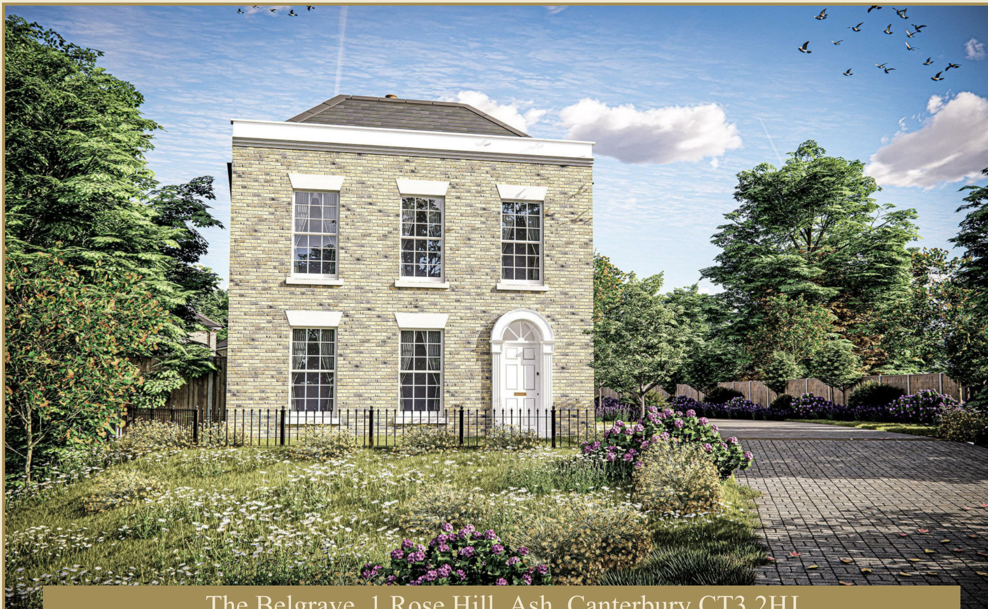
The Belgrave, 1 Rose Hill, Ash, Canterbury CT3 2HJ