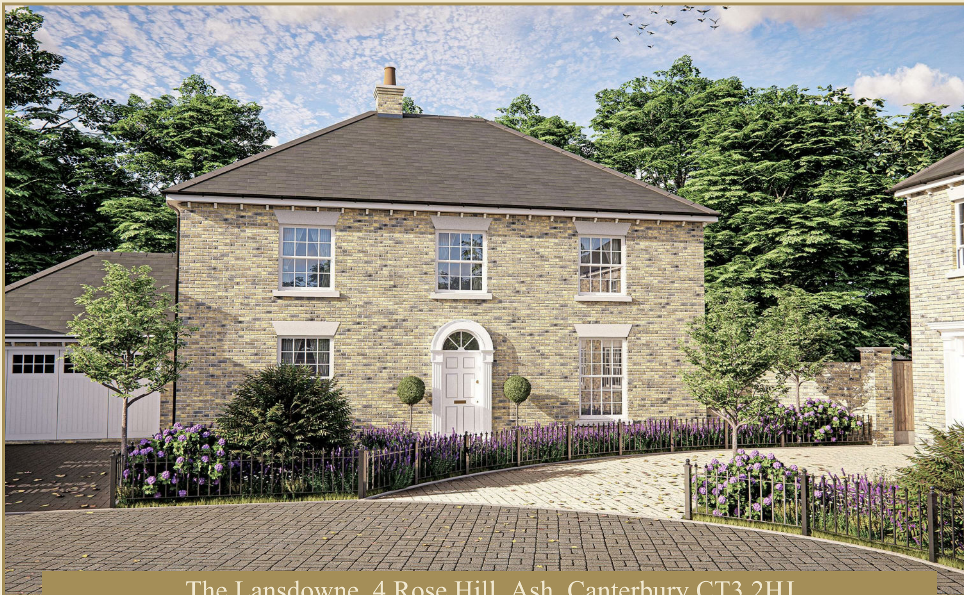
The Lansdowne, 4 Rose Hill, Ash, Canterbury CT3 2HJ